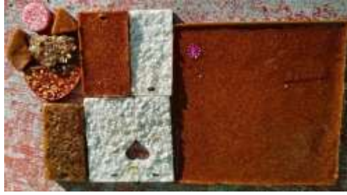
Photo showing hard material prepared by students