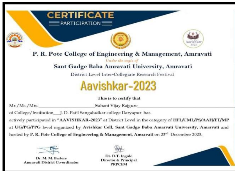
Certificate of Participation