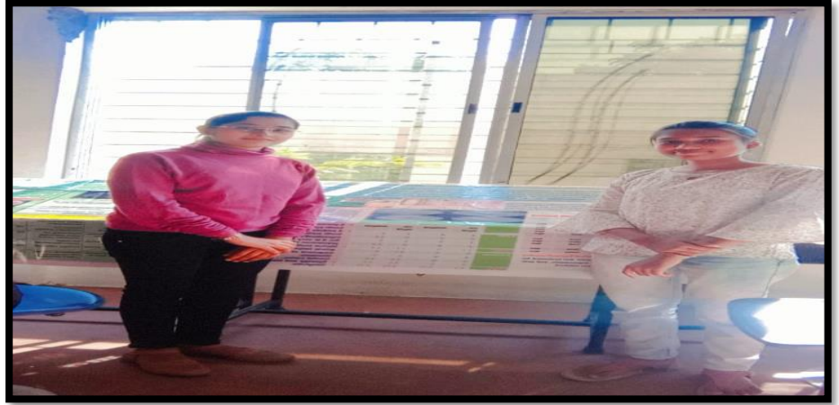
Students poster Presentation at Avishkar competition