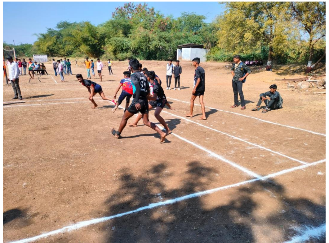
College Level Sports Event